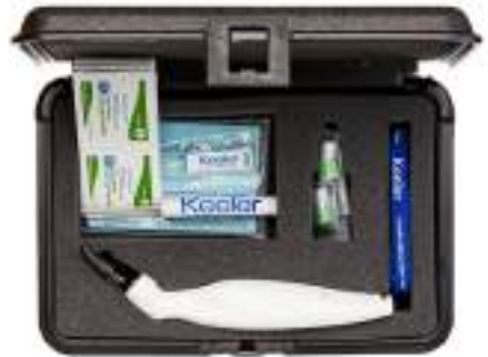
Figure 3.1 - PachPen unpacked