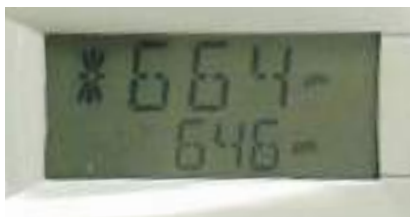
Figure 3.6 - Measurement screen starting new patient