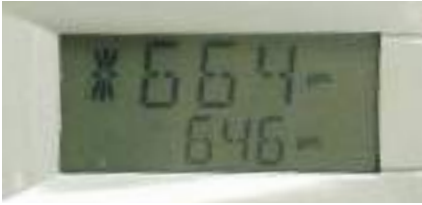
Figure 3.4 - Speed of sound screen