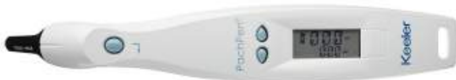
Figure 1.1 - PachPen pachymeter

The Keeler PachPen pictured below has all the features that make it easy to obtain extreme accuracy and improved patient outcomes.