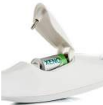
Figure 3.2 - Battery insertion