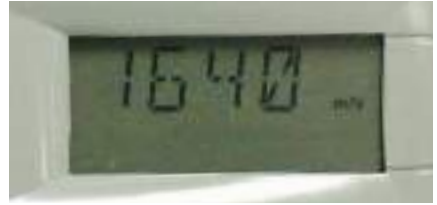
Figure 3.5 - Measurement screen