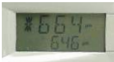
Figure 3.7 - True IOP screen