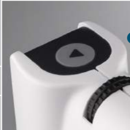
Icare® AMS Automatic measuring sequence: series- and single mode with one button.